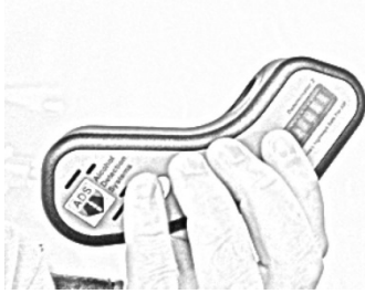
How to properly hold the device during test!