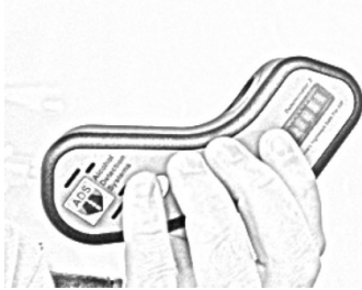
How to properly hold the device during test!