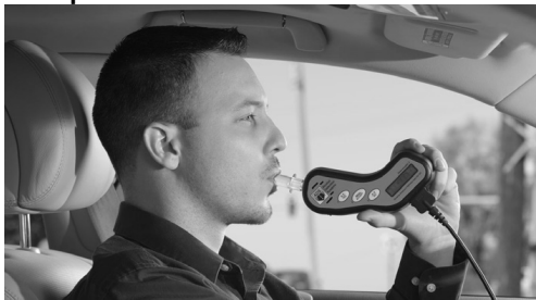
2.1. Determinator Hand Held

ANY SERVICE INQUIRIES SHOULD BE MADE TO ADS 888-786-7384 or 702-473-5504