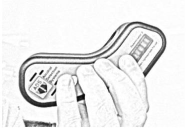
How to properly hold the device during test!