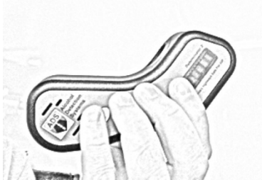
How to properly hold the device during test!