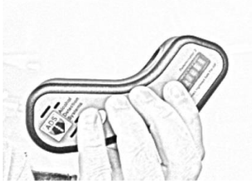
How to properly hold the device during test!